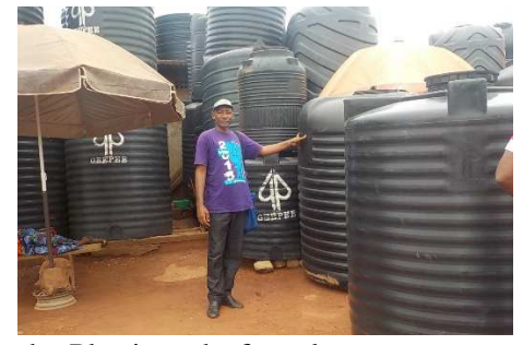
Effata helps young people to find work and to get a training on the job after study. Plastic tanks for sale everywhere.