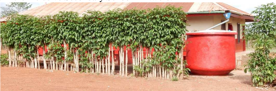
Big experimental tank of 15000 litre and red tank at Inclusive Primary and Secondary School in Nwofe.