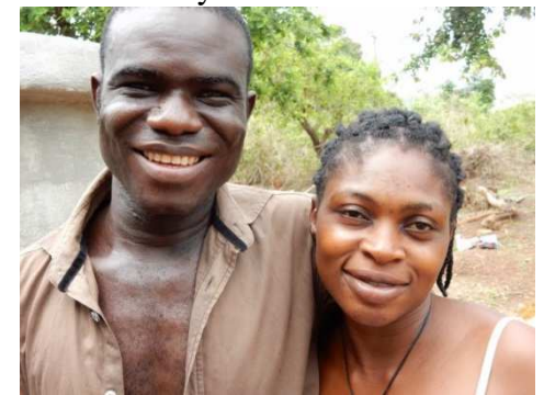
The man on the right side is a plumber, he just married and made a special tap (middle) for his wife.